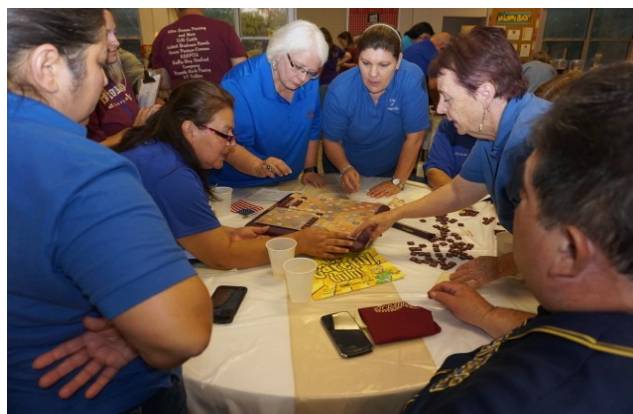
The City of Kingsville Literacy Supporters came out and played a mean game of SCRABBLE. Their table was sponsored by Hahn & Oldham