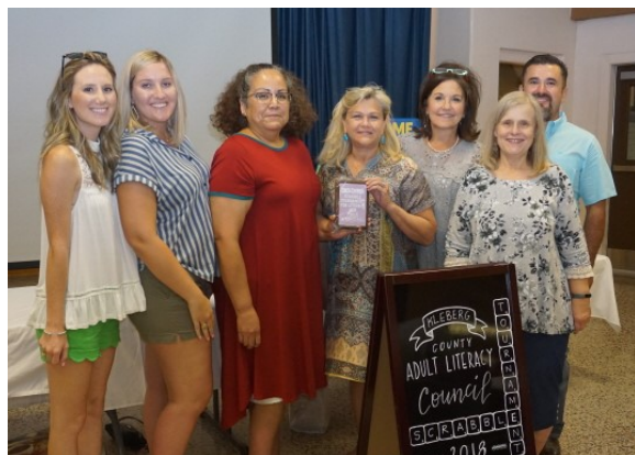
Our top winning school district was Riviera ISD. Pictured are members of the Riviera ISD Literacy Supporters.